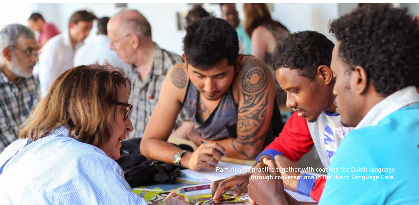
Participants practice together with coaches the Dutch language through conversations in the Dutch Language Café.

If you are interested, please send a motivation letter and your CV to info@devoorkamer.org . If you have any questions, please feel free to contact us!