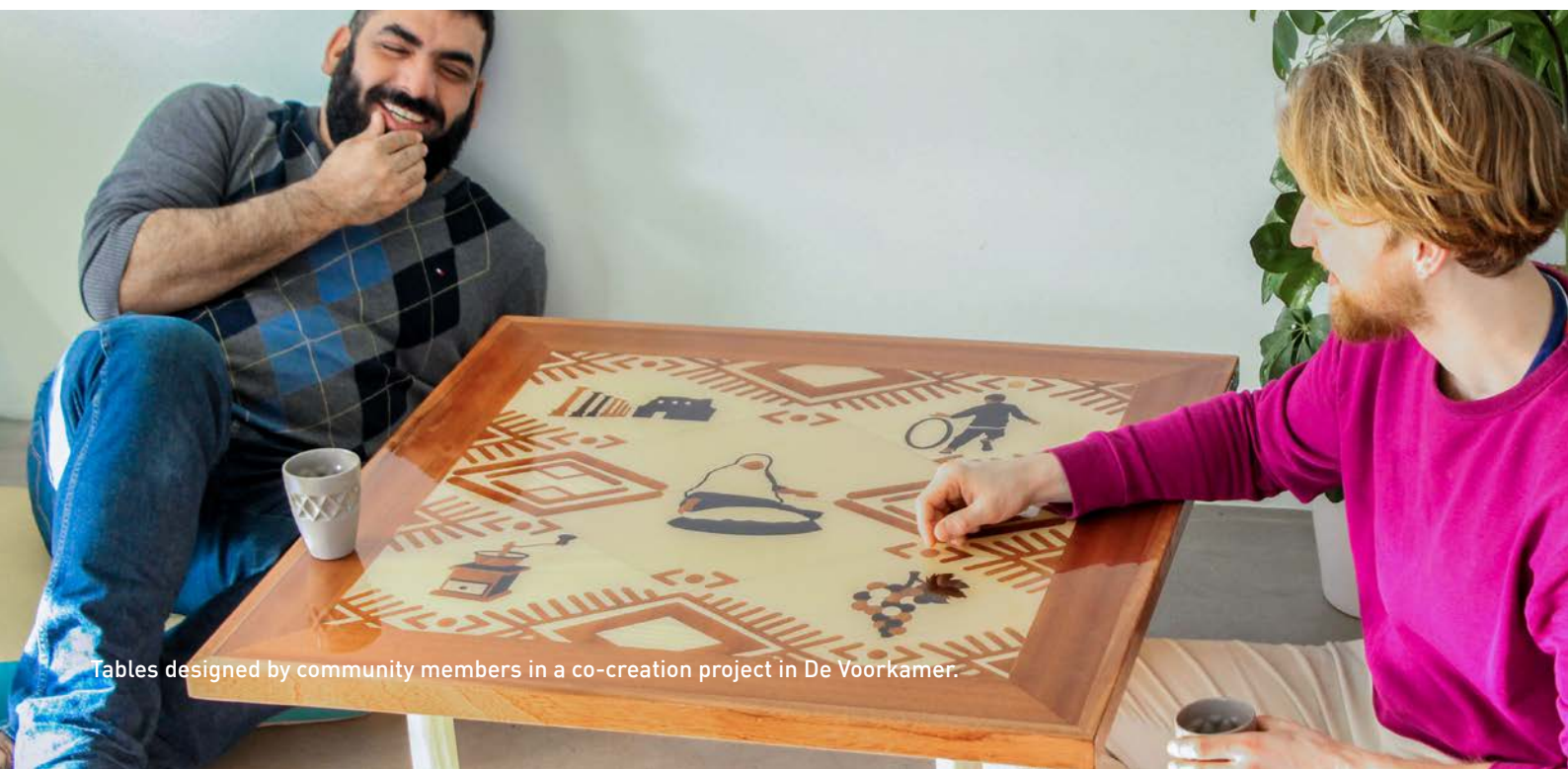
Tables designed by community members in a co-creation project in De Voorkamer.